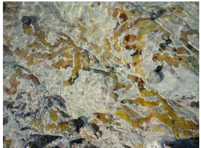
‘Sfumato by sea periwinkles.

Imaging idealises. “Artists tried to modify nature according to the idea of beauty they had formed when looking at classical statues – they ‘idealized’ the model” (Gombrich 2006: 244).